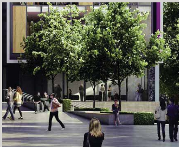
Green space Mature trees retained and a strong, well-defined planting palette