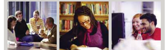
Library spaces A change to the frontage creates a stronger character for study spaces