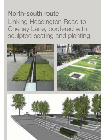
North-south route Linking Headington Road to Cheney Lane, bordered with sculpted seating and planting