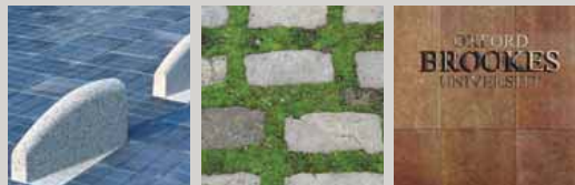
Making an entrance High quality, robust materials and university services that are easy to access