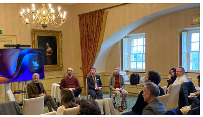
Artificial Intelligence and Data Network

More details here: www.brookes.ac.uk/research/ networks/children-and-youngpeople/events/2023/childrenand-young-people-festival-ofresearch