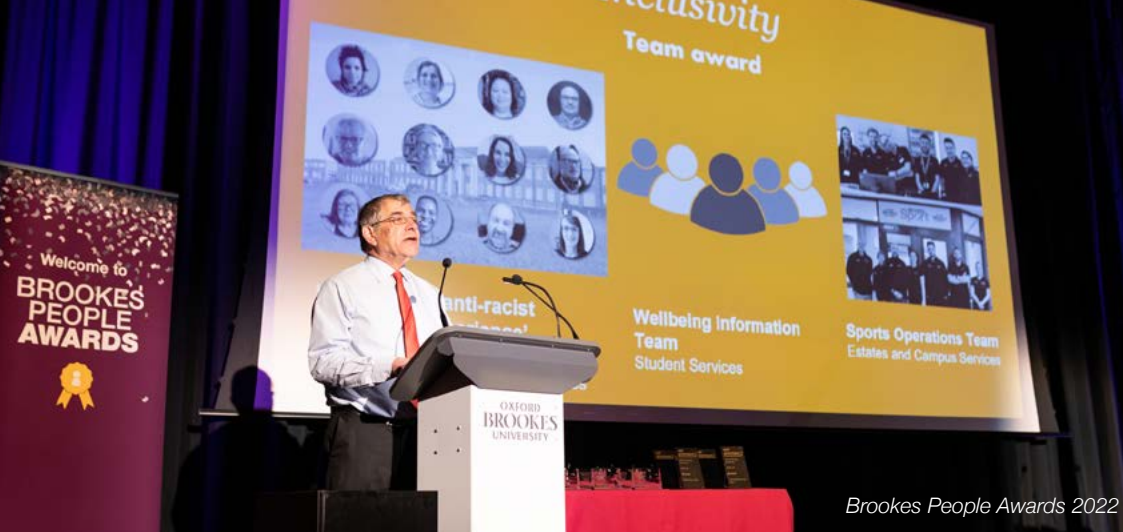
Brookes People Awards 2022