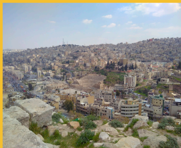
Downtown urban Amman

Blog: https://wordpress.com/posts/e2e.home.blog