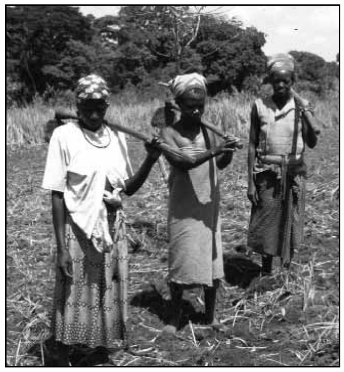
Women working in the field

Leading international conservation agencies have named human-wildlife conflict as a conservation priority for the century. Growing competition between people and wildlife, through increasing human population and habitat fragmentation and degradation, are cited as potential causes of human-wildlife conflict. Conflict may also escalate through increasing animal populations, as a result of successful conservation programmes, and/or the declining value of wildlife to local people – a consequence of the change from wildlife as common property to state-owned, and thus state controlled.