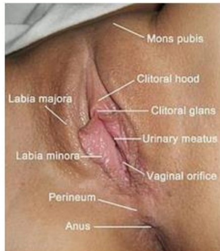
Figure 2: An annotated image of the vulva

Although the term vagina is predominantly used to refer to a woman’s genitals, it is a specific term for one part of the genitals. Vulva refers to the female genitals in their entirety (see figure 2).